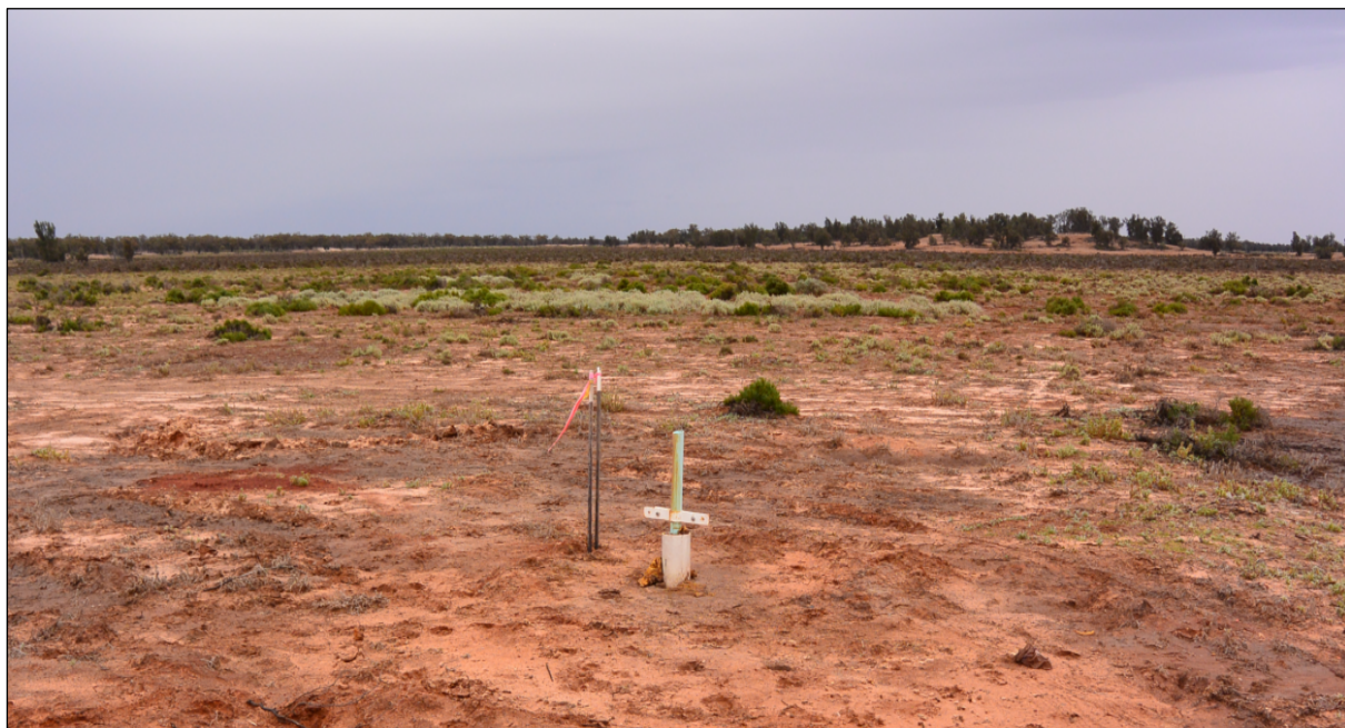
Figure 4: Site B , bore location with view east across salt lake surface

The four test-production bores will be installed at two sites, with a shallow bore into the upper aquifer and a deeper bore into the basal aquifer at each site. The Company is reviewing consultant proposals to conduct the test-pumping program, scheduled to commence upon the completion of the bore installation program, with results expected in the December quarter.