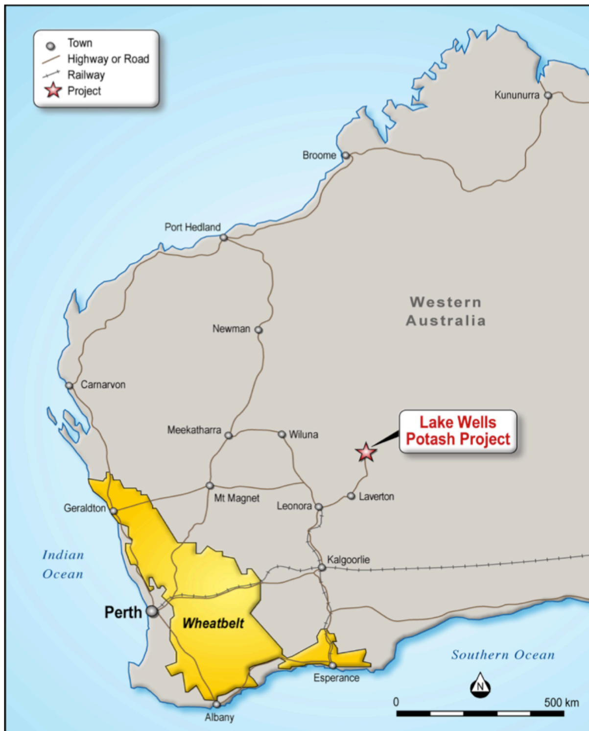
Figure 1: The Lake Wells Potash Project

Goldphyre Resources (ASX: GPH) is pleased to announce the test production bore installation program at its rapidly emerging Lake Wells Potash Project is due to commence early August 2016.