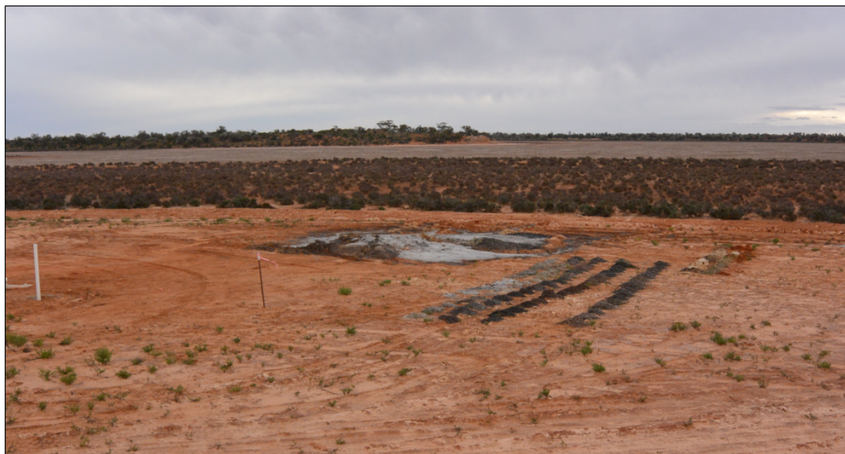
Figure 3: Site A , bore location with view south to lake surface

The installation of the simple, low-cost test production bores will be followed by test pumping, with the aim of confirming Lake Wells' status as a leading WA potash project, building on its superior high-grade Resource and close proximity to infrastructure.