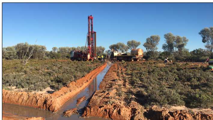
Figures 5 & 6: Right, piercing the basal sand layer and channeling the natural overflow to containment bund

At the same time, geotechnical test-work on potential trial evaporation pond sites, and laboratory evaporation and crystallisation trials, have commenced.