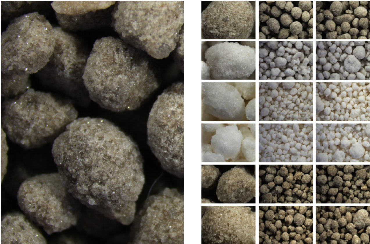
Figure 1: LSOP granulated product showing well-formed granules

FEECO is recognised globally as an expert in process design and manufacturing solutions for complete fertiliser systems and turnkey production facilities including bulk material handling, granulation technology and control systems.