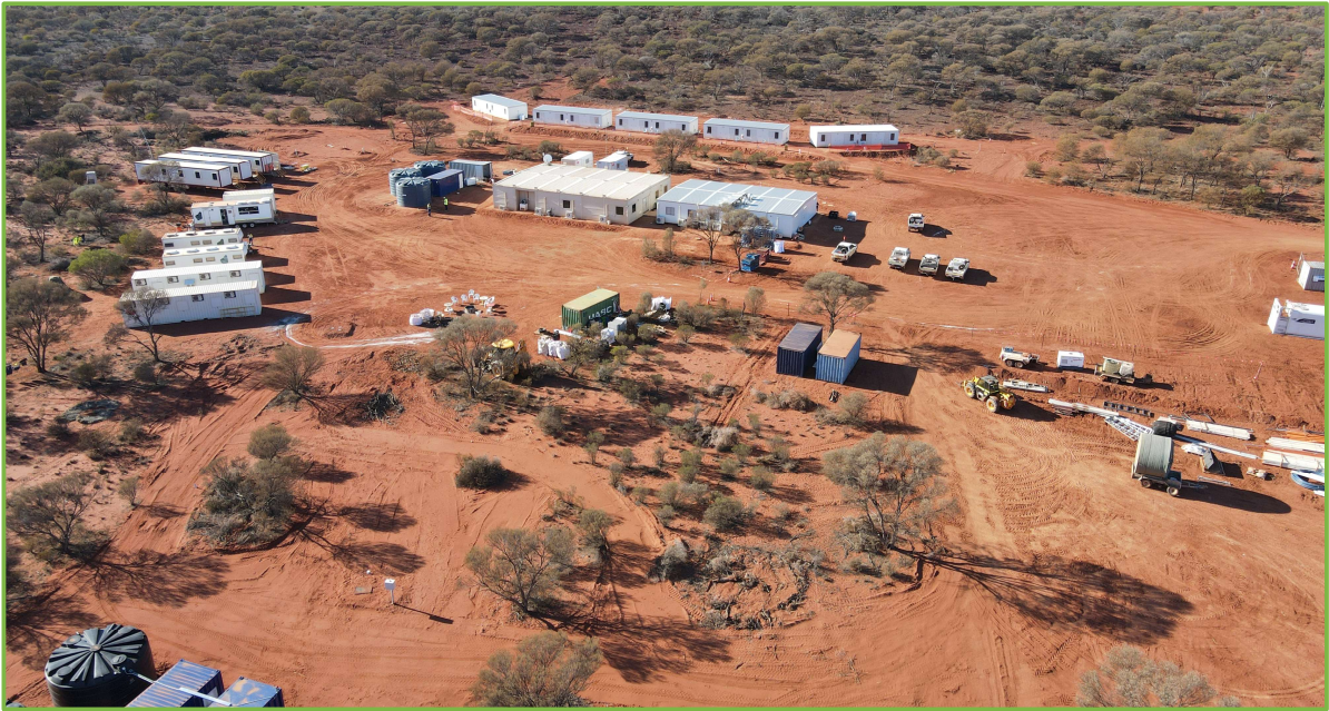
Figure 5: Aerial view of Lake Wells Village

This release was authorised by the Board of the Company.