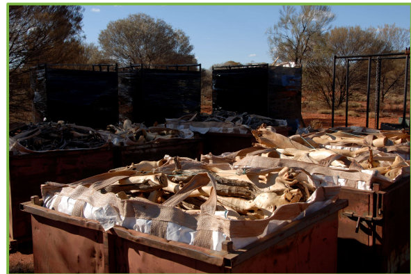
Figure 4: Sandalwood harvesting