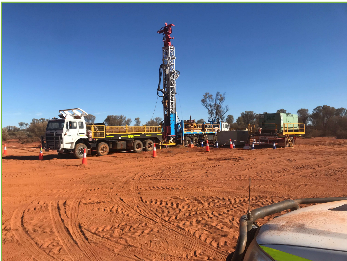
Figure 1: Brine production bore drilling at LSOP

A program of step rate testing commenced within the past week to obtain information on the condition and efficiency of selected production bores drilled in this program. Constant rate testing is planned to assist in determining bore yields.