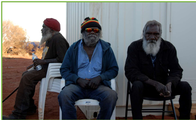
Figure 3: Senior lawmen at LSOP heritage survey

A program to salvage a large quantity of sandalwood where the harvest ponds will be constructed at Lake Wells was also conducted during September. The works were undertaken by Yonga Djena, a local indigenous company. APC assisted with the works by providing ablution facilities and raw water supply. A piece of sandalwood from Lake Wells will be procured from the Forest Products Commission to be mounted and displayed at the APC head office.